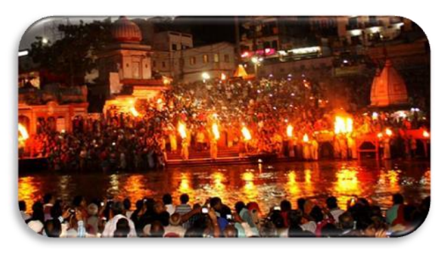
Day 10: Pipalkoti/Chamoli -Haridwar

After breakfast proceed to haridwar. This day we will vist dev Prayag, Rupdraprayag.